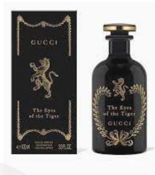
Gucci - Vanilla Firenze