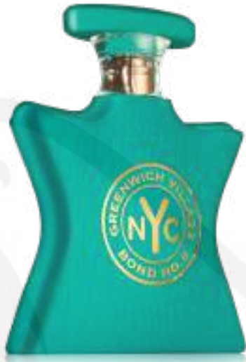
Bond No. 9 - NYC Greenwich Village