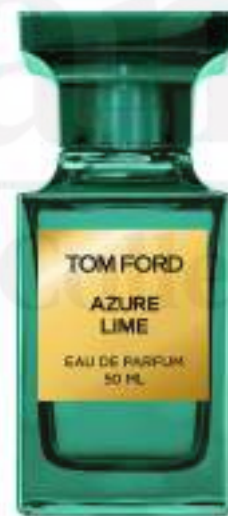
Tom Ford – Azure Lime