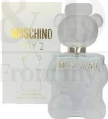
Moschino - Toy 2